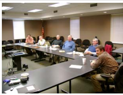
Pickens City Council Retreat ACOG facilitated seven council retreats and four board orientations in January, February, and March.

goal-setting sessions for the town councils of several Upstate municipalities including Belton, Williamston, Pickens, Gaffney, Inman, Woodruff and Central. ACOG-facilitated retreats are typically conducted at the Council of Governments offices in Greenville and focus on the development and prioritization of both long term and short term council goals and objectives. ACOG staff members also frequently participate in retreats conducted and facilitated by local city, county and special purpose district managers onsite.