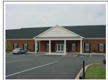
The Blakely Funeral Home in Gaffney, a very successful local business, was partly financed by Development Corporation loans.

The ADC was recently honored by the SBA as one of its "Top Lenders" in the 504 loan program for the past year.