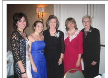
Some of ACOG's dedicated Aging staff at a recent awards ceremony. In the first six months of 2007, ACOG directly and indirectly assisted many thousands of Upstate seniors.

ACOG Aging contract funds have assisted 9,488 seniors in the region through the provision of: 661,185 miles of transportation; 16,365 hours of home care assistance; 413 hours of Alzheimer's respite care; 253 days of adult day care service; 580 hours of legal assistance; 18,723 hours of wellness and exercise activities; 5,020 hours of care management service; 2,902 minor home repair units; 350 health screenings; 560 high risk nutrition screenings; 1,602 health promotion activities; 9,150 hours of physical fitness activity; 5,611 consultations on medication management issues; 62,835 home delivered meals; and, 91,317 group dining meals.