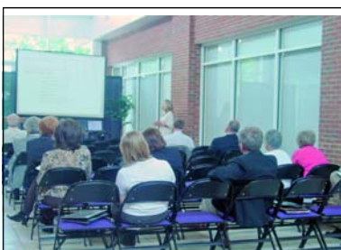
The 2007 Spring Job Fair , held at Clemson's Littlejohn Coliseum, is just one of the many ways ACOG's Work-Link team promotes employment in the Upstate.