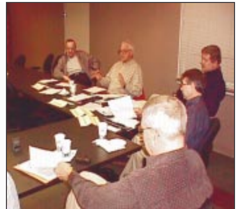
The Easley City Council recently spent a relaxed day in the ACOG board room addressing general policy direction and City priorities.

A number of Upstate municipal councils conducted strategic planning retreats during the months of January and February. The Appalachian Council of Governments staff assisted the Cities of Spartanburg, Gaffney, Easley, Landrum and Woodruff either by facilitating and directing the meetings or by making presentations during the course of the retreats. The Council of Governments has traditionally taken a very active role in working with city and county councils, helping them to establish long-term goals and objectives and prioritizing their needs.