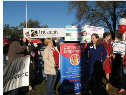
The live morning broadcast of Fox Carolina took over the town of Pendleton on Veterans Day, November 11, featuring WorkLink's Priority of Service for Veterans.

WorkLink Workforce Investment Board gives priority of service to veterans and eligible spouses. This service policy aligns with the Jobs for Veterans Act and ensures that those who have served our country move to the front of the line for employment and training services. For more information about the services available to job seekers, visit http://www.worklinkweb.com/sc-jobseekers.php .