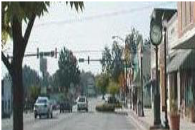
Downtown Woodruff, SC is a key element in the city's newly approved comprehensive plan.

The City of Woodruff approved the update of their comprehensive plan during the November council meeting. While the current plan served to guide the community since the original plan was adopted in 1998, the update addressed key developments and changing trends including redevelopment efforts, changing demographics, and transportation issues that will impact the future of Woodruff.