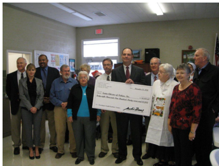
Senior Citizens of Pickens, Inc., awarded grant money for building renovations.

Senior Citizens of Pickens, Inc., was awarded a grant through the S.C. Senior Center PIP (Permanent Improvement Program) to enhance energy efficiency in the Hagood Center. The funds will be used to replace windows in the center and to provide vinyl boxing around the exterior of the build-