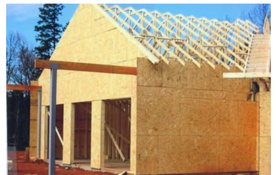
Construction is underway on the new Cowpens Senior Center, which will house a host of activities and programs for the senior population living in Cowpens and the surrounding vicinity.

College, Spartanburg County School District 3, Mobile Meals of Spartanburg, and the Boys and Girls Club of Spartanburg.