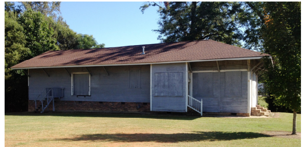
Williamston will be renovating the historic depot into a farmers market.

The Town of Williamston has received a $66,130 grant to renovate the historic train depot into a farmers market. Their market currently meets in Mineral Spring Park on an intermittent basis. Renovating the depot will allow for indoor facilities and regular weekly markets during the growing season.